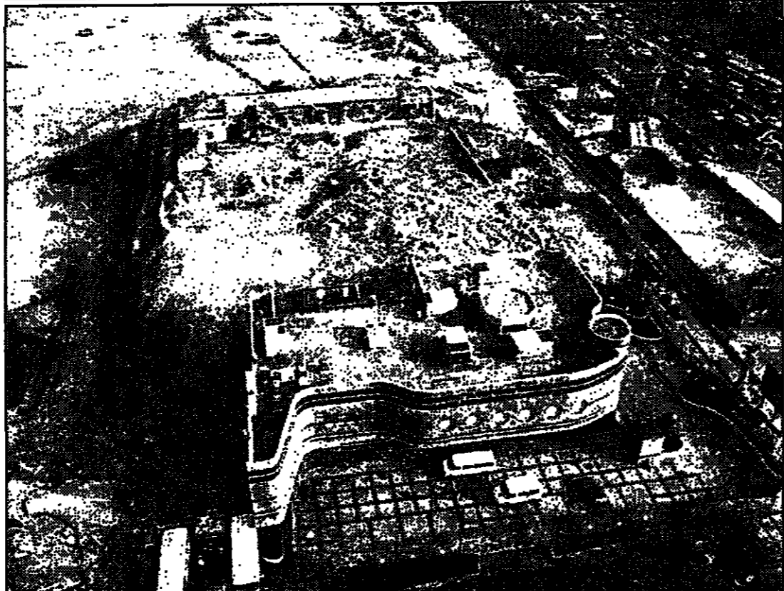
The building which until Sunday was the largest McDonald's restaurant in the world stands anonymous in central Beijing yesterday after all the signs were removed.

the gas companies would cancel their appeals and promise to obey his rules for signing supply contracts in the future.